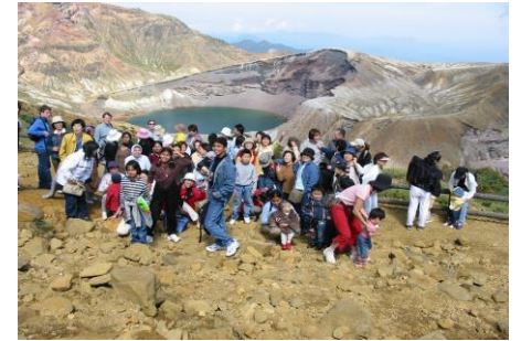
Trip to Mt. Zao

Additional activities are organized throughout the year, including a field trip, parties, a bazaar, and several Japanese traditional events.