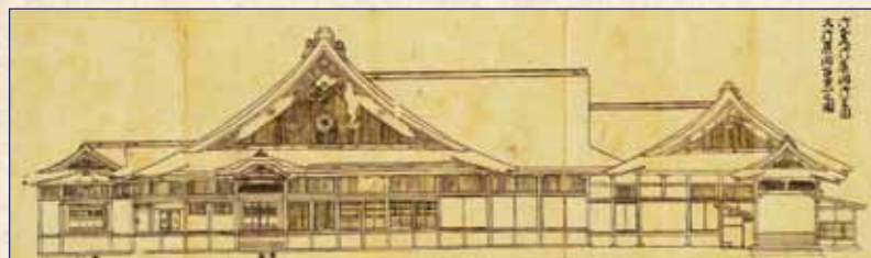
Chida Family Drawing (Main Compound Ohiroma portion) (Sendai City Museum)

The Main Compound was divided into a public front half and private back half, and contained many buildings. The main building was the Ohiroma, completed in 1610. The Ohiroma was a magnificent building with a total of 14 rooms, and including the porch around its perimeter, had a floor area of about 430 tatami mats. To the north of the Ohiroma was a Noh stage, and another building overhung the cliff to the east.