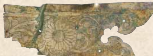
Excavated Gilt Bronze Metal Fitting

There is a full-size reproduction of the alcove in the Jodan-no-ma Corner. You can see its size and its magnificent wall paintings.