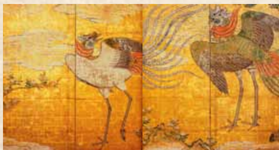
Folding Screen with Phoenix (Town of Matsushima)

There is a full-size reproduction of the alcove in the Jodan-no-ma Corner. You can see its size and its magnificent wall paintings.